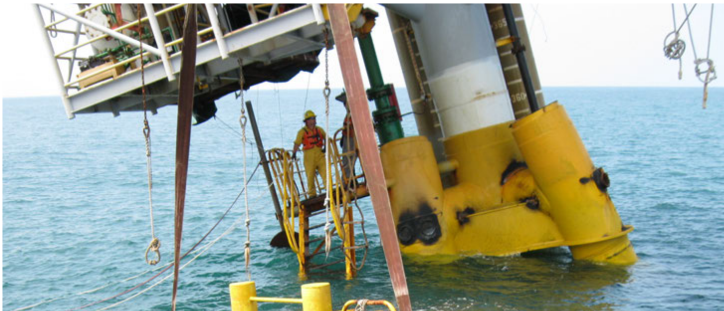
Example of debris removal to lighten the topside loading on a damaged wellhead platform

The Damaged Platform Structural Survey includes a thorough review of the as-built platform, accommodations, equipment, and wellhead/wellbores both above sea level and below. This is compared to the actual condition of the platform after damage (through pictures and measurements) to model the damaged platform for developing platform removal modelling, planning safe access, and all future intervention planning.